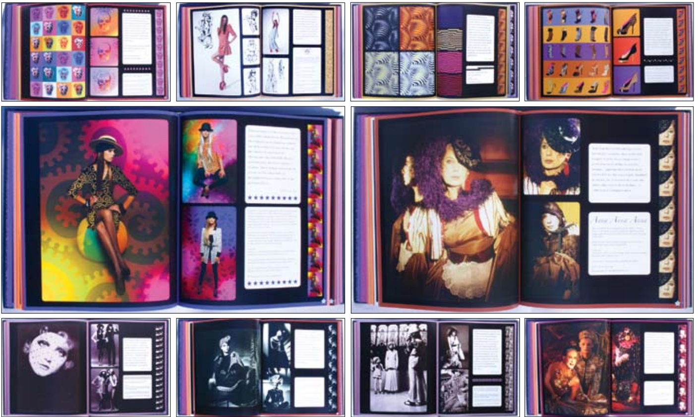
BARBARA HULANICKI SEAMLESS FROM BIBA A Life in Design 29 November 2012